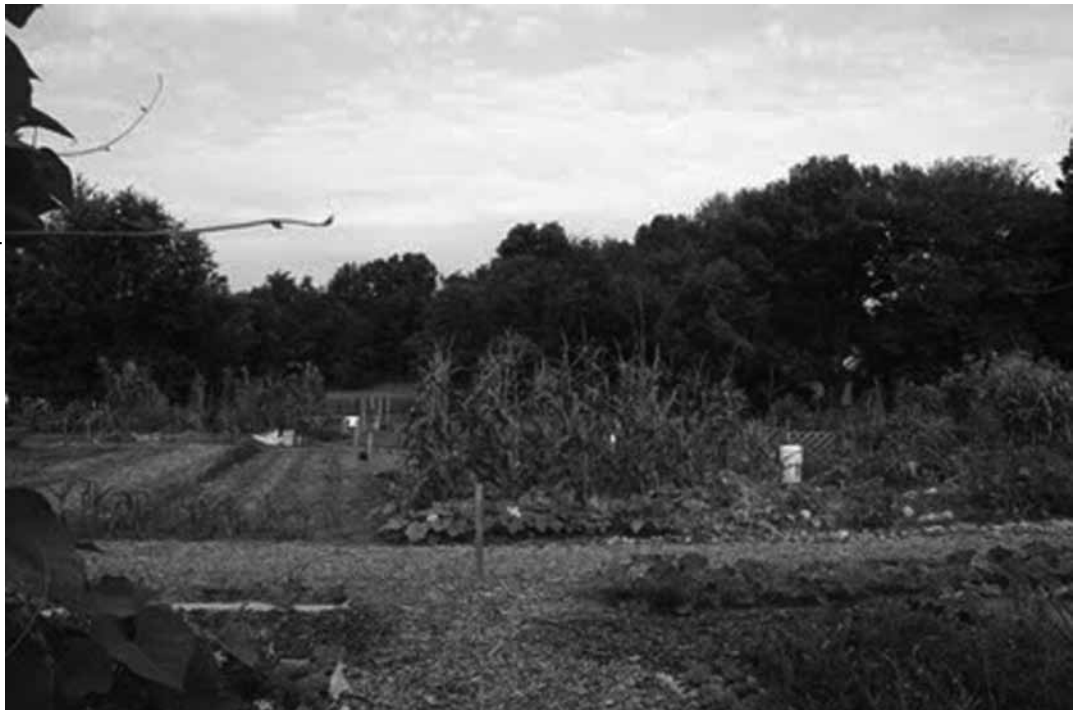
A view from inside the Community Garden

I hope to be back next year, if only to benefit from what I learned this year. It's a wonderful opportunity, but you'll have to work to make it worthwhile.