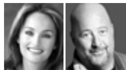
Giada De Laurentiis Bizarre Foods Chef Andrew Zimmern

FRIDAY, AUGUST 1– SATURDAY, AUGUST 2 MUSIC CENTER, MANSION & GROUNDS