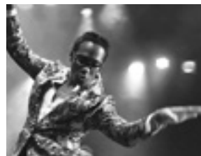
Sandy Hackett's Rat Pack Show