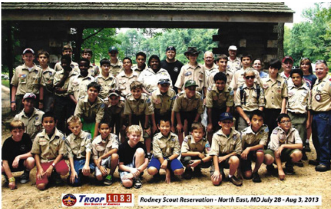
Troop 1083 took Camp Rodney by storm this year – again!!!