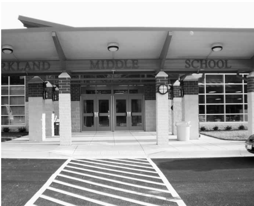
View of Parkland's new main entrance

Loiederman MS (old Belt) also welcomed back students on August 27th with some noticeable new exterior