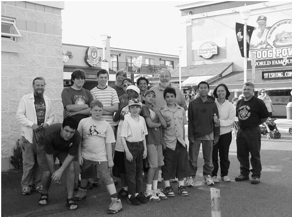
Troop 1083 at the Ocean City boardwalk during the Assateague campout.