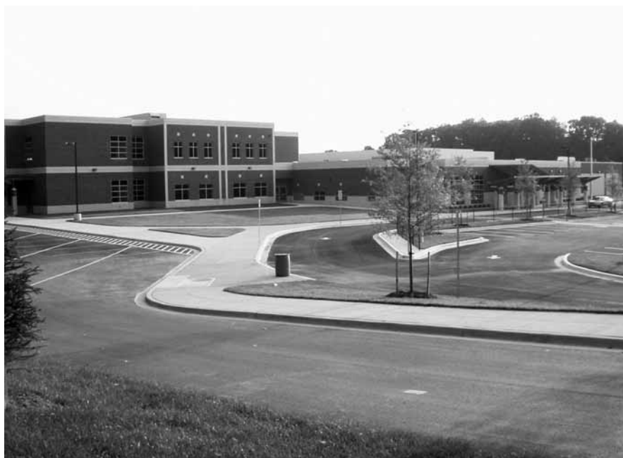
Site view of the completed renovation at Parkland.

The RCA welcomes all our new school administrators and staff. Best wishes for great success to all RCA-land students as we start the new school year. ■