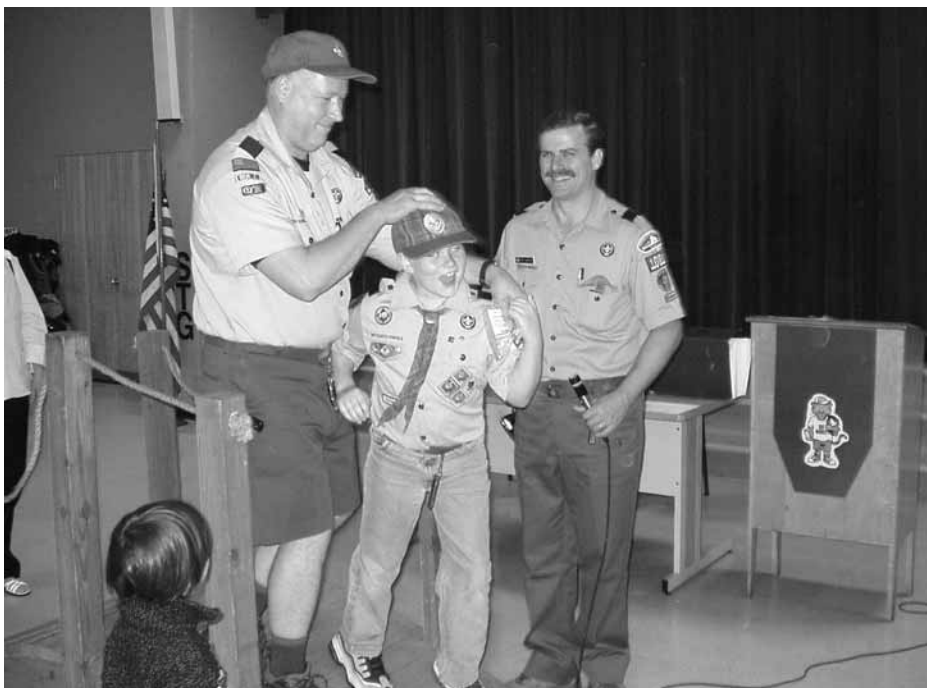
Fun and excitement fill the room at the May Pack Meeting Graduation Ceremonies.