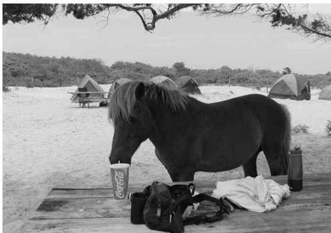
Wild horse at our Assateague Island campsite.

In mid-June we recognized the recent achievements of many of our scouts at our summer Court of Honor. All the merit badges earned and rank advancements attained at that time will be recapped in next month's Echo .