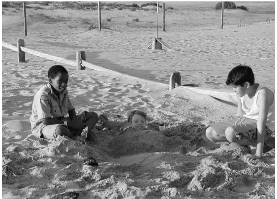
Our campsite at Assateague Island.

In early June, the scouts fielded a team in the American Cancer Society's Relay for Life fundraiser at Kennedy HS. Adult leaders fielded a team, too. The event is an all-night marathon walk, and participants collect donations in advance of the event. The combined effort of scouts and troop leaders raised over $5,300 to fund cancer research