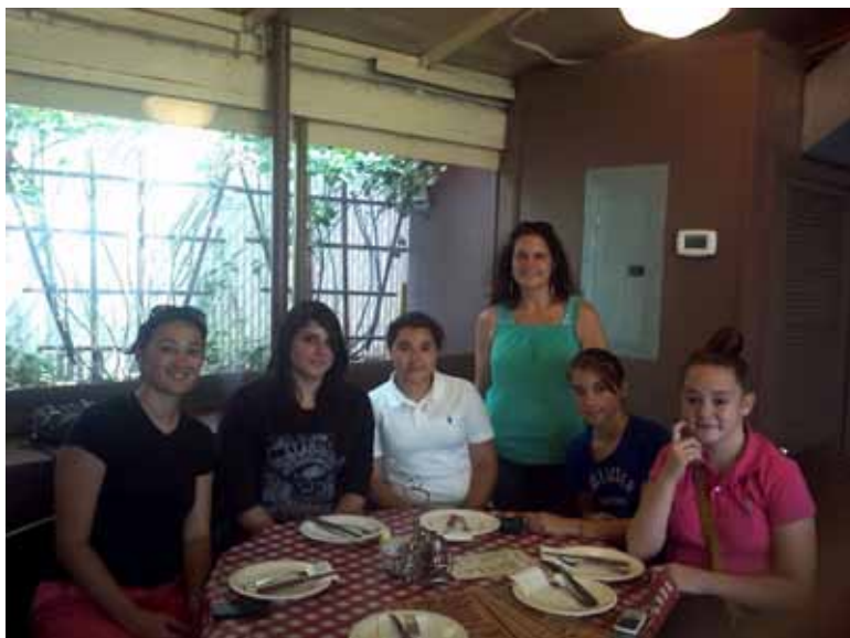
Troop 1079 in New York City