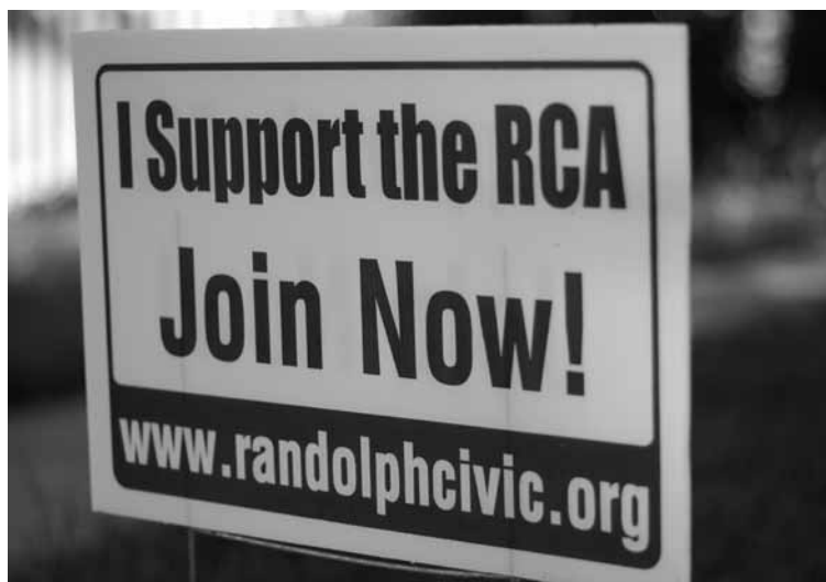
Time to put out your RCA yard signs!

Please fill out the membership form completely. Because of turnover, the RCA does not have every (new) homeowner's name, so please supply your name if the previous occupant has moved. The only thing that never changes is the address! If you did not get a membership form, envelope, or lost yours, please email info@randolphcivic.org to have one dropped off at your house. Alternately, if you would like to have your membership form and dues picked up by an RCA volunteer rather than mailing them, you can reach us at info@randolphcivic.org and we'll make the arrangements.