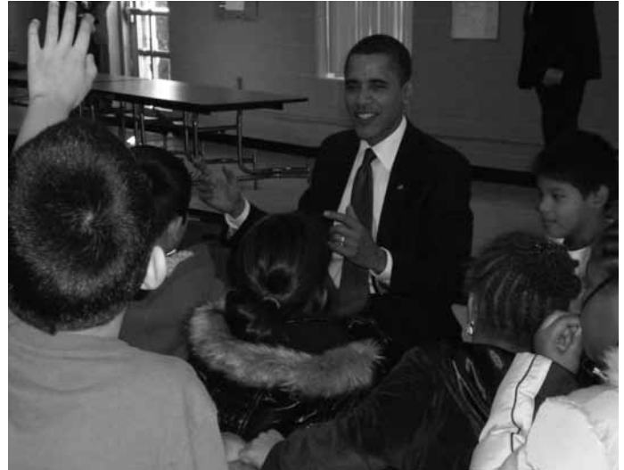
President Obama visited VMES last October

The PTA at Viers Mill Elementary School is looking forward to another great year! Our Parent/Teacher Association is a group of parents, caregivers, teachers and administrators who work together for the welfare and education of our children. Some of our activities include providing funds to teachers for classroom books, sponsoring students' cultural arts programs, planning a Spring Fair for the whole community, supporting Family Learning Nights and other fun activities, and organizing Scholastic Book Fairs. We always appreciate the support of our community. Whether you can offer a little or a lot of your time, talent or treasure, we welcome your help! Membership is only $10. The PTA is open not only to parents and caregivers but also individuals and businesses in our community! Donations made above your membership dues are tax-deductible!