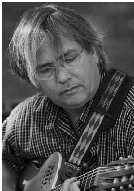
Carlos Munhoz performs