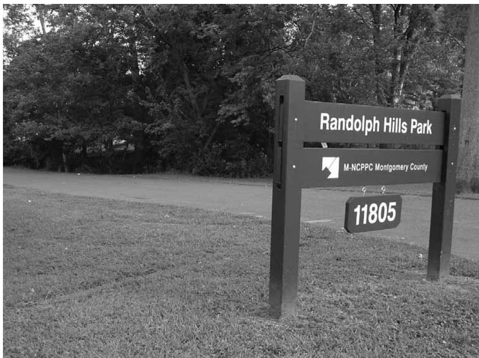
The Entrance to Randolph Hills Local Park is the beginning of the walk

(Part two of this article will be in the December Echo along with many photos from the park.)