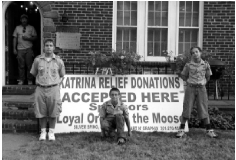
Troop 1083 helps collect donations for Hurricane Katrina victims.

As part of the Boy Scout commitment to community service, members of Troop 1083 participated in a Katrina