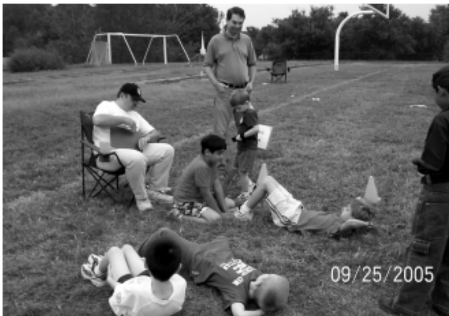
Cub Scouts warm up before competing in Physical Fitness Day at Wheaton High School.