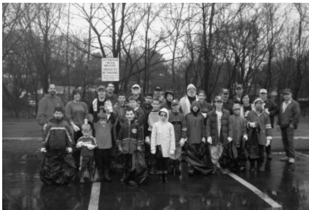
Our Potomac Watershed Day Cleanup crew ready to attack the Boiling Brook Creek.