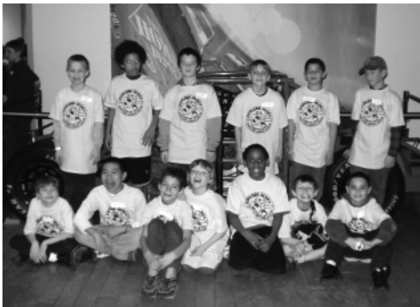
Junior Webelos scientists at the Maryland Science Center.