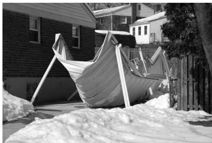
Snow crumples a Randolph Hills carport

Our patience and understanding regarding this