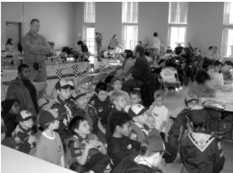
Scouts eagerly awaiting race results at the Pinewood Derby.