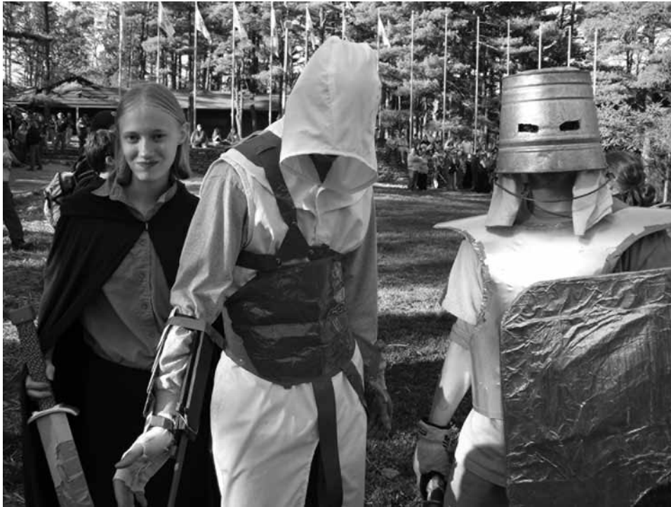
Venture Crew 1083 members, or dangerous characters from the 14th century?