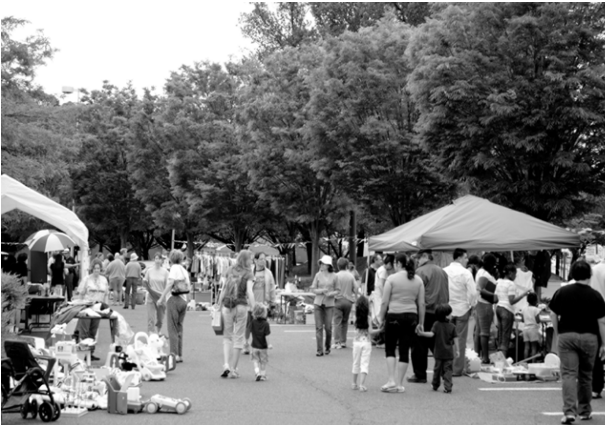
The May 2010 Community Bazaar was blessed with nice weather and a great turnout.