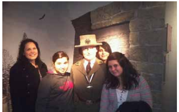
Troop 1079 posing with Juliette Low's wax figure