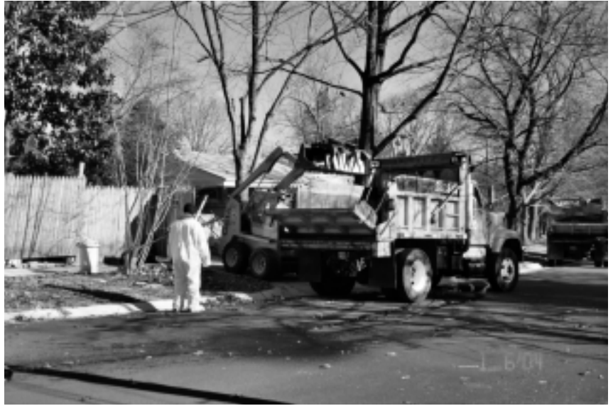
Update: As the Echo went to press in January, County crews were cleaning up the code violations at the house on Ashley Drive.

An RCA'er asked about "Fort Ashley" – the house in gross violation of the housing codes. The judge set a deadline of November 16th to clean it up. The house was still out of compliance at press-time. The next step is for the County to clean it up, hauling away all the debris, and billing the homeowner. A tax lien could be placed against the property.