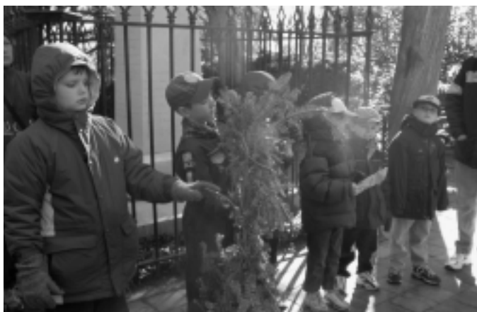
Our Cub Scouts are at Mt. Vernon preparing for the wreath laying ceremony.