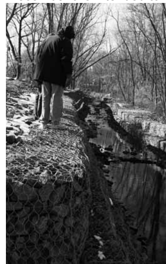
Looking down at Boiling Brook