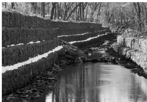
A stretch of Boiling Brook

Following the record rainfalls and flooding in 2006, the county shored up the banks of Boiling Brook with gabion baskets (wire mesh baskets filled with rocks) to prevent erosion from damaging the nearby roadway. Soon after