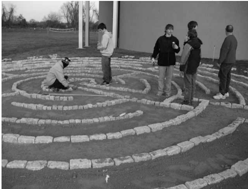
Working on one of two Eagle Scout service projects completed in December.

For the second consecutive month, two of troop 1083's senior scouts conducted their Eagle Scout service projects, each over several weekends ending