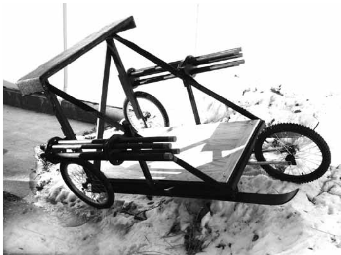
Q: What exactly is this? A: It is awesome.

December was a bit of a slow news month for Venture Crew 1083. Our much-anticipated outing to the Potomac Curling Club was, ironically enough, postponed by snow. Curling, if you're wondering, is a peculiar yet very fun-looking winter Olympic sport played on ice with brooms and "rocks." The rocks look sort-of like flat-bottomed bowling balls with handles, or spout-less, 25-pound tea kettles. How can that not be fun? So we'll try again later this winter.