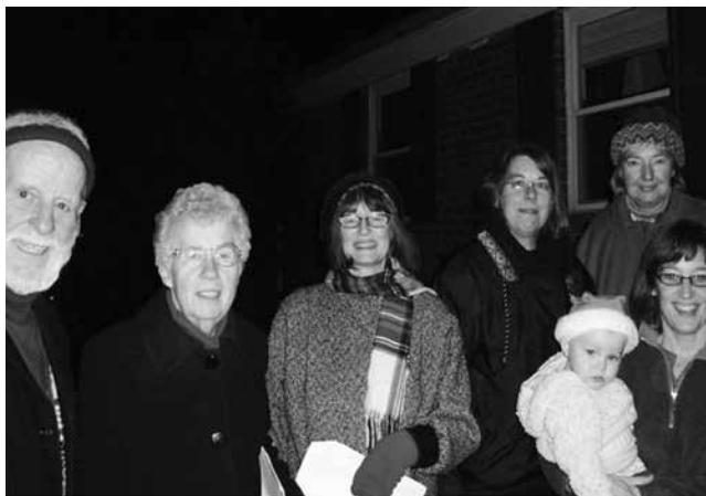
RCA-Land Caroling Returns. See page 3 for details.

hosting three free events as part of their Holiday Open House Series. Sunday December 5 is "Art, Music and Holiday Cheer", featuring artworks, vocalists, and a bell choir. The open house is from 1 to 4 pm. Sunday December 12 is "Children's Sunday" and will feature visits by Santa, Rudolph and Frosty, as well as musical performances. This event also goes from 1 to 4pm. And Sunday December 19 is "Music and Merriment" featuring three different singing groups including, at 3:15pm, the Victorian Lyric Opera Company. For (continued on page 6)