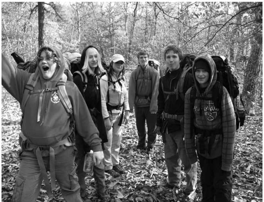
Venture Crew 1083 Hiking the Blue Ridge on a Frosty Morning