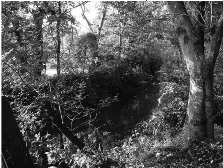
A view of the creek from the trail

From one week to the next (while I'm gratefully counting every single day where it hasn't happened yet) the summer heat arrives. The greens on my forest walk have deepened, and the shadows have darkened. The mid-day heat is curiously still. Busy bumble bees seem to tumble drunkenly from one blossom cluster to the next. I walk more slowly now, taking a rest on the little bench, watching the water-weavers make circles on the surface of the stream that comes lazily around the bend. The air is heavy with the shrill of the cicadas, growing in intensity,