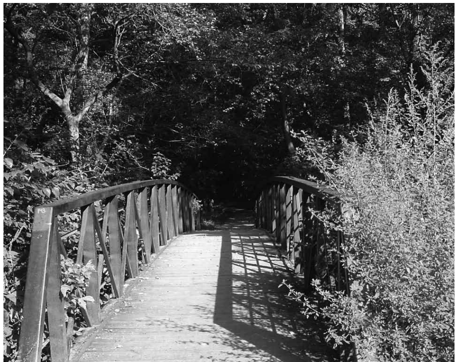
The bridge in Randolph Hills Local Park crossing Rock Creek

In the winter, everything is wide open here. One can see the "bones" of this (continued on page 9)