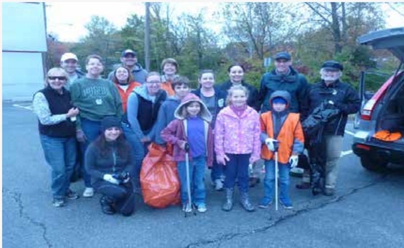
At left, community volunteers at the previous Community Cleanup, on October 24th.

We had beautiful fall weather for the recent clean-up of RCA land on October 24th. Sixteen neighborhood volunteers worked together to pick up trash along Boiling Brook Parkway, at the dead-end of Macon Road behind Safeway, and from behind the bench on Ashley Drive at Coachway. The Randolph Civic Foundation has adopted Boiling Brook Parkway through Montgomery County's Adopt-A-Road program, which obligates us to conduct at least 6 clean-ups there per year. With additional volunteers, we're able to get that done and expand our efforts to other parts of the neighborhood that need attention. So please join us for our next clean-up on Saturday, December 5th. As usual, we'll meet at 9 am in the parking lot of Randolph Hills Shopping Center, and RCF will supply gloves and trash bags. Help us get the neighborhood looking great in time for the winter holidays! If you would like more information, or if you have suggestions for places in the neighborhood that need to be cleaned up, email me at mcanick@hotmail.com .