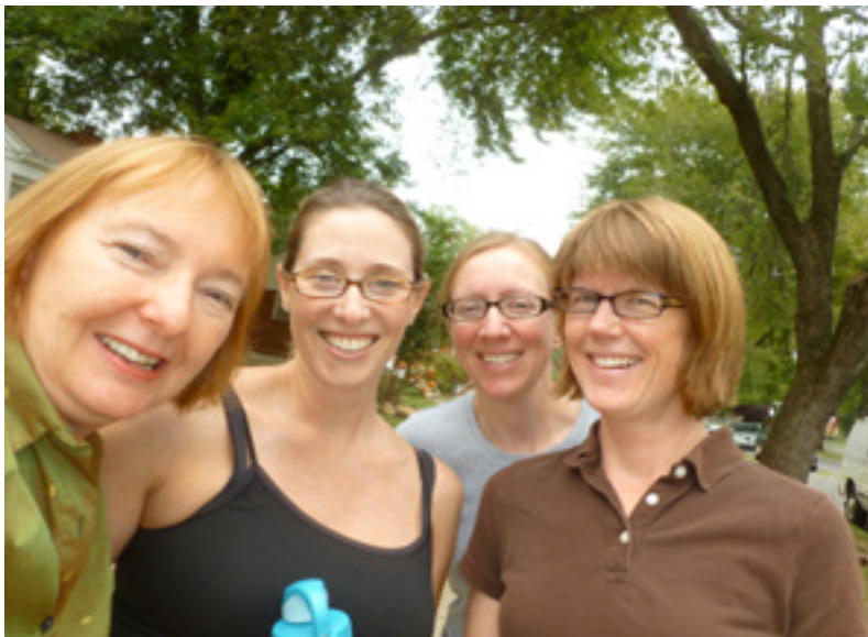
Who brought the cookies? They brought the cookies.

helps, starting right here with The Echo, the volunteer-run neighborhood newspaper that you find on your doorstep every month (or so), distributed by our intrepid Boy Scouts. More communication, in real time and disseminated swiftly, via our Randolph Civic list-serve, our yahoo group, helps us spot a lost dog, alerts us to a road closing, invites us to a regional planning meeting, or refers us to local contractors. Apart from this utility-aspect, I often get a sense of comfort