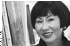
An Evening with Amy Tan FRI, NOV 15, 8PM

Classic Albums Live: The Beatles Sgt. Pepper's Lonely Hearts Club Band FRI, NOV 29, 8PM