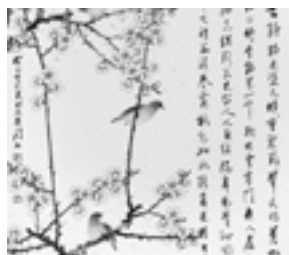
Liang Wei, Plum Flower, detail

A Fine Line: Calligraphy, Language & Symbol SEP 21-NOV 10