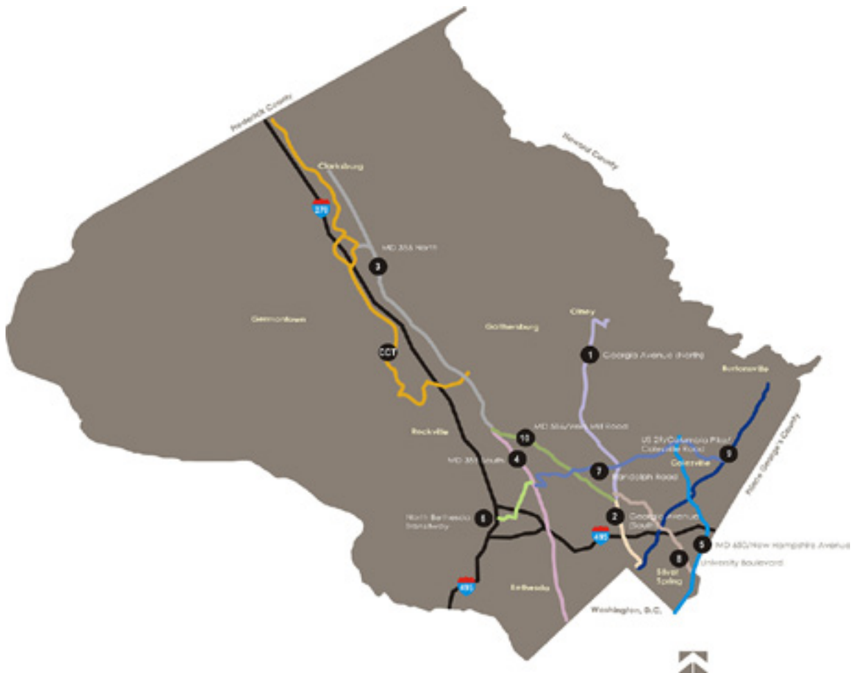
Proposed Routes of the Montgomery County BRT Network