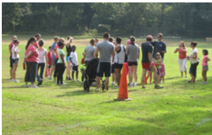
Runners gather for instructions

It was great once again to have cow-bells, cheering, and laughing in our local park! We hope you will join us next year to continue to build on the success of the event.