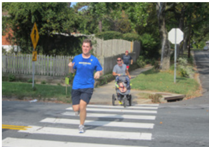
Runners make their way through Randolph Hills